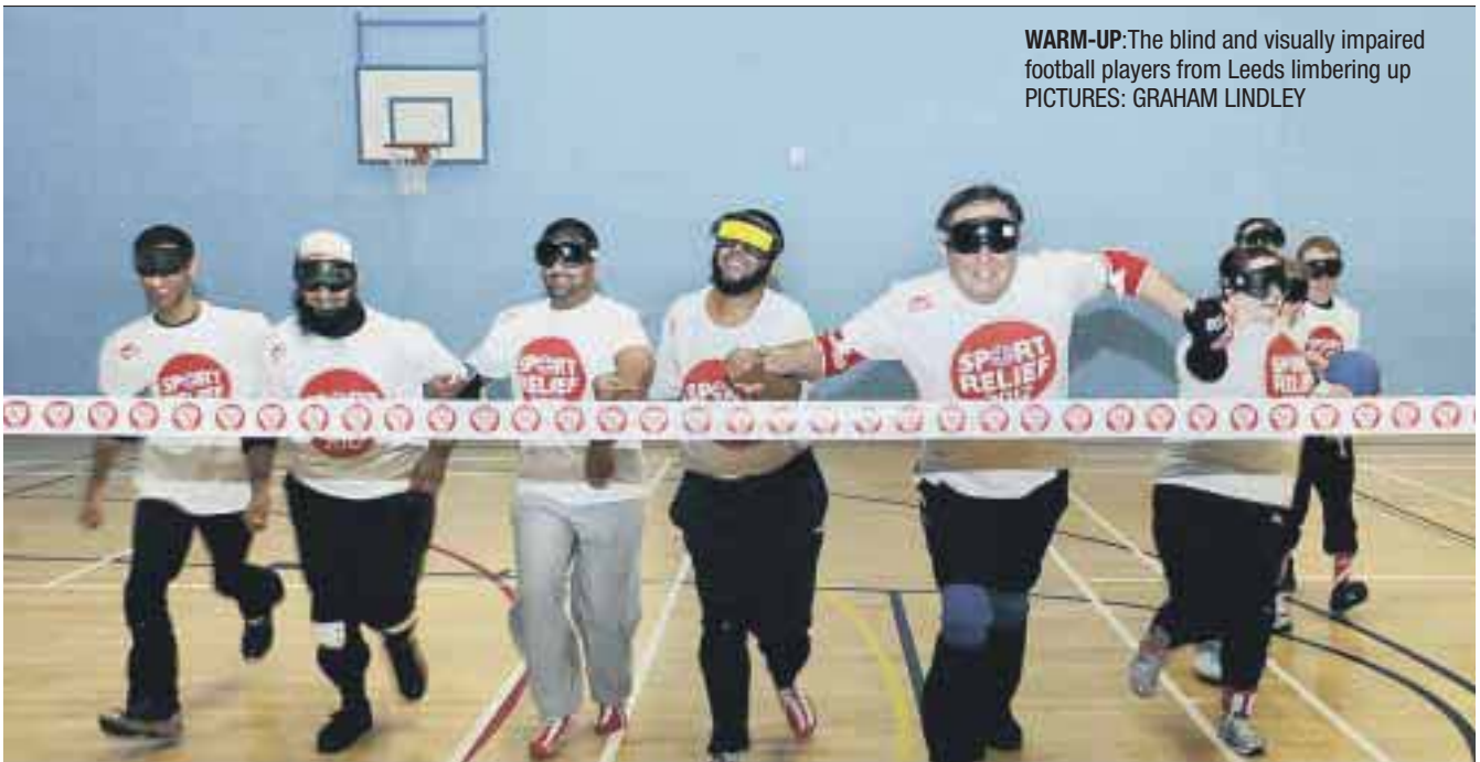
WARM-UP: The blind and visually impaired football players from Leeds limbering up